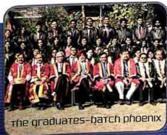
the graduates - batch phoenix