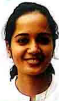
Department of Oral and Maxillofacial Surgery.