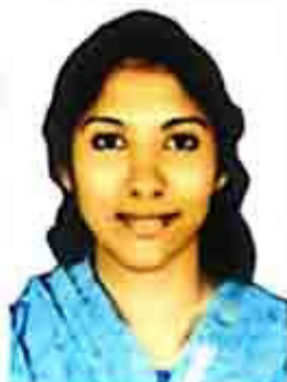
Department of Conservative Dentistry and Endodontics.